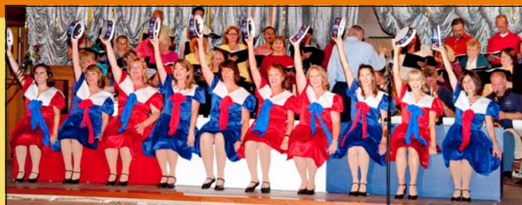
"Hooray, for our Favorite Son!" Crowd pleaser!