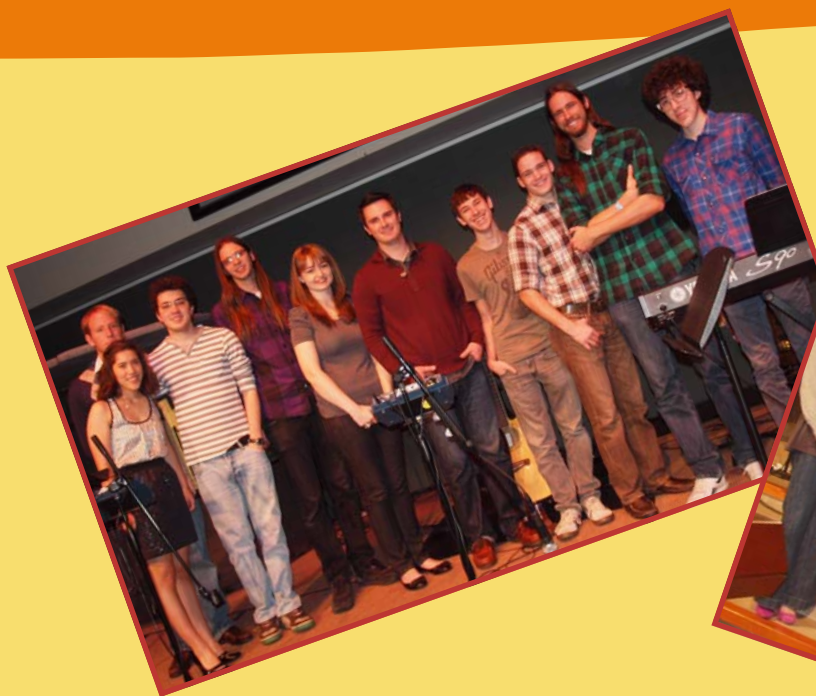
College/Graduate/Seminarian Sunday-DEC 26